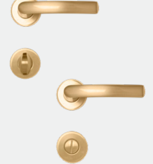
Roses Satin bronze