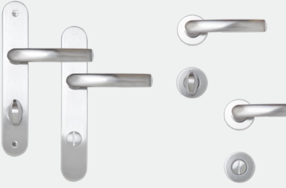
Handles for internal doors