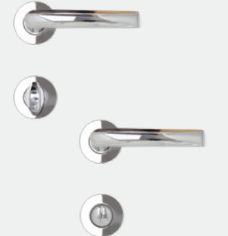
Roses Polished silver