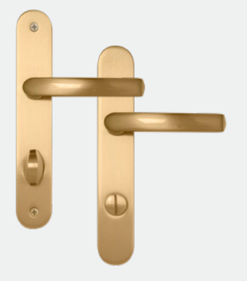
Handles for internal doors