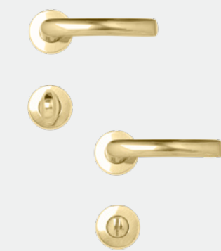
Roses Polished gold