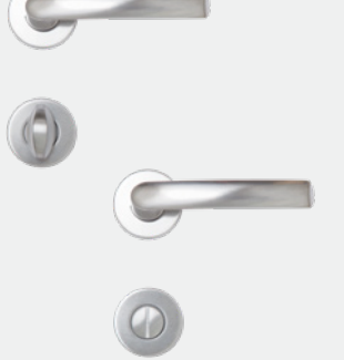
Roses Satin silver