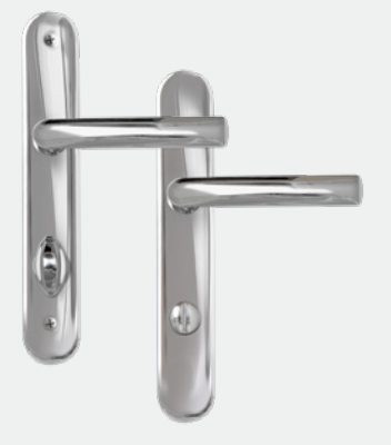
Handles for internal doors Polished silver