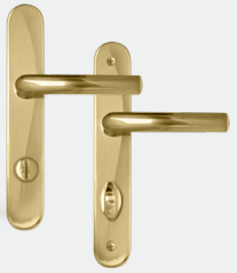
Handles for internal doors Polished gold